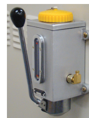
Optional EvenFlow™ reservoir and pump