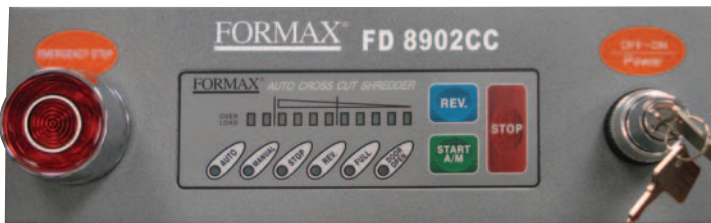
LED control panel with visual load indicator and safety key lock

The FD 8902CC offers unmatched automated features through its LED control panel. The easy-to-read Load Indicator assists operators in determining how close they are to the maximum shred capacity to avoid jams and provide optimal efficiency. Operators can select from two modes of operation: Auto Start/Stop or Manual. Auto Start/Stop mode utilizes optical sensors which detect paper and start/stop operation automatically. Manual mode provides non-stop operation for shredding small sized paper or films. The Safety Key Lock prevents unauthorized use of the shredder.