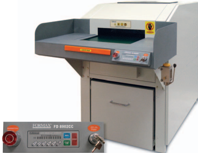
LED Control Panel with Load Indicator