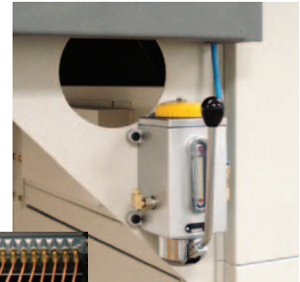
EvenFlow™ reservoir and pump

The FD 8902CC features the EvenFlow™ Automatic Oiling System to keep the shredder in peak operating condition. The easy-to-use pump combines with 25 copper distribution nozzles to lubricate the steel cutting blades.