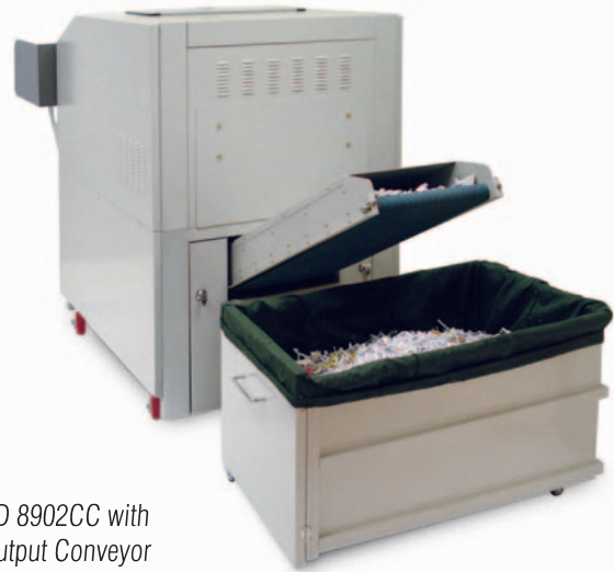
FD 8902CC with Output Conveyor